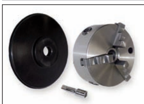
Balancer Chuck 40mm 8113330