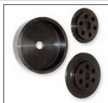
Deep Offset Kit 40mm 8113042