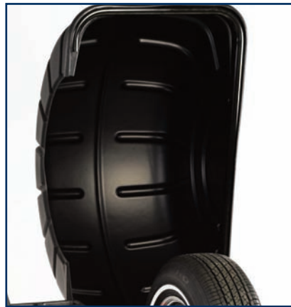
Auto Start Hood